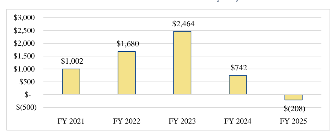
Consensus Tax Revenue Estimate vs. Tax Revenue Assumption for Current Year GAA

budget writers were developing the FY 2023 GAA, they had access to nearly $2.5 billion in new tax revenues compared to the figure they used to build the FY 2022 budget. In FY 2025, the consensus revenue figure is actually $208 million less than the revenue base used to build the FY 2024 GAA.